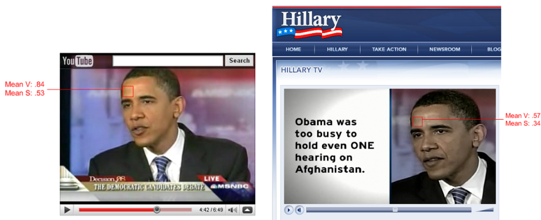
Figure 3: Video still capture from original MSNBC footage (via YouTube) and ad on Clinton campaign website

The images in Figure 3 above show video stills that I captured from the Clinton campaign website and the original MSNBC footage (from YouTube). The package includes the polygons that correspond to the facial coordinates of Obama's face in each image clintonpoly and msnbcpoly respectively, so we simply create a new image from those coordinates, make sure the polygon is capturing the correct portion of the image via the plot function, and generate saturation and value readings.