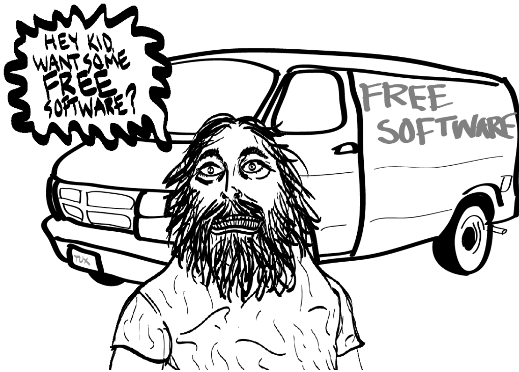
Figure 1: The GNU GPL Explained